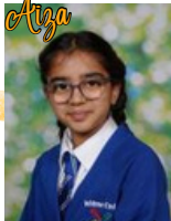
Arza Shining Star Award

A reminder that, should you need to make a phone call to school, there is a chance it may not be answered immediately. We make every endeavour to answer every call but this is not always possible. If you could please leave a voicemail message, the office team will then immediately receive a file containing that call in the office email inbox. On return to the office, we can then listen to your call and respond accordingly. We hope this will give you some time back so you have no need to call again or email the office with the same query.