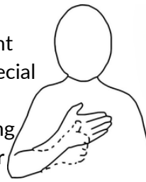
Flat hand moves slightly forward to become a 'good' hand.

Lots of our children have been brave this week, for all different reasons! Can you think of a special time when you had to have courage to overcome something difficult? Sharing this with your child gives them confidence to overcome scary times.