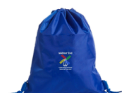
PE Kit Bag