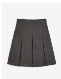
Grey School Skirt (Pleated or Plain)