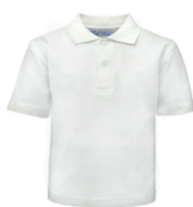
White Polo (EYFS & KS1)