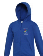
PE Zip Hoody

We kindly request that children wear shorts, skorts, joggers, or leggings during PE sessions. To uphold our children's modesty, we permit the wearing of loose-fitting or knee-length cycling shorts. These shorts should be easily visible underneath the PE T-shirt. Alternatively, children may choose to wear cycling shorts underneath regular shorts. Your cooperation in ensuring that your child is dressed according to these specifications is greatly appreciated. If you have any questions or require further clarification, please do not hesitate to contact the school office.