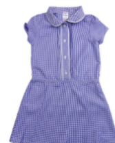
Summer Dress or Playsuit