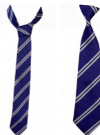
Elasticated or Standard Tie