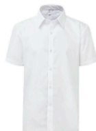
White Collared Shirt (KS2)