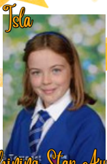
Shining Star Award

Our Year 1 children have been to Woolly Firs today on a trip which they thoroughly enjoyed and Year 6 visited Holmer Green Senior school to participate in a volleyball tournament. Our children always represent the school so well on days like these and get so much from their time away from school. Thank you to all the parents who helped accompany the children.