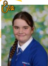
Shining Star Award