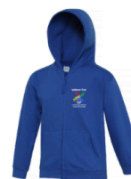
PE Zip Hoody

We kindly request that children wear shorts, skorts, joggers, or leggings during PE sessions. To uphold our children's modesty, we permit the wearing of loose-fitting or knee-length cycling shorts. These shorts should be easily visible underneath the PE T-shirt. Alternatively, children may choose to wear cycling shorts underneath regular shorts. Your cooperation in ensuring that your child is dressed according to these specifications is greatly appreciated. If you have any questions or require further clarification, please do not hesitate to contact the school office.