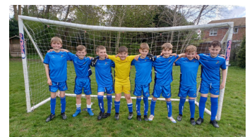
Widmer End 1 - Manor Farm 3

I think we played well as a team and did the best we could. We should have had more shots, if we did we probably would have scored more. I think the luck just went Manor Farm's way, we had several shots that were saved and some went wide. We also hit the crossbar.