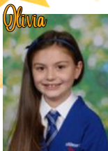
Shining Star Award

Please find attached to this newsletter a letter written collectively as headteachers within the CAP group of schools about the results of the 'smartphones in school' survey. Thank you to all families who answered this survey. It is an excellent first step towards a safer digital world for our children.