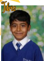
Shining Star Award